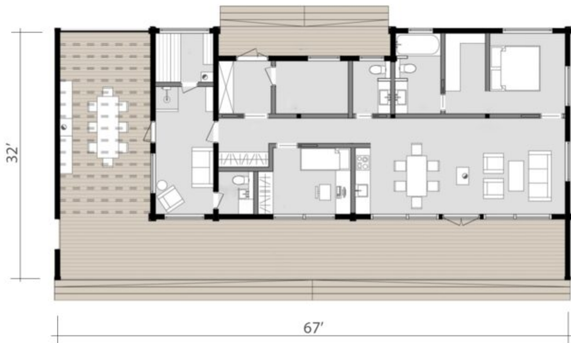
FLOOR PLAN OPTION #2